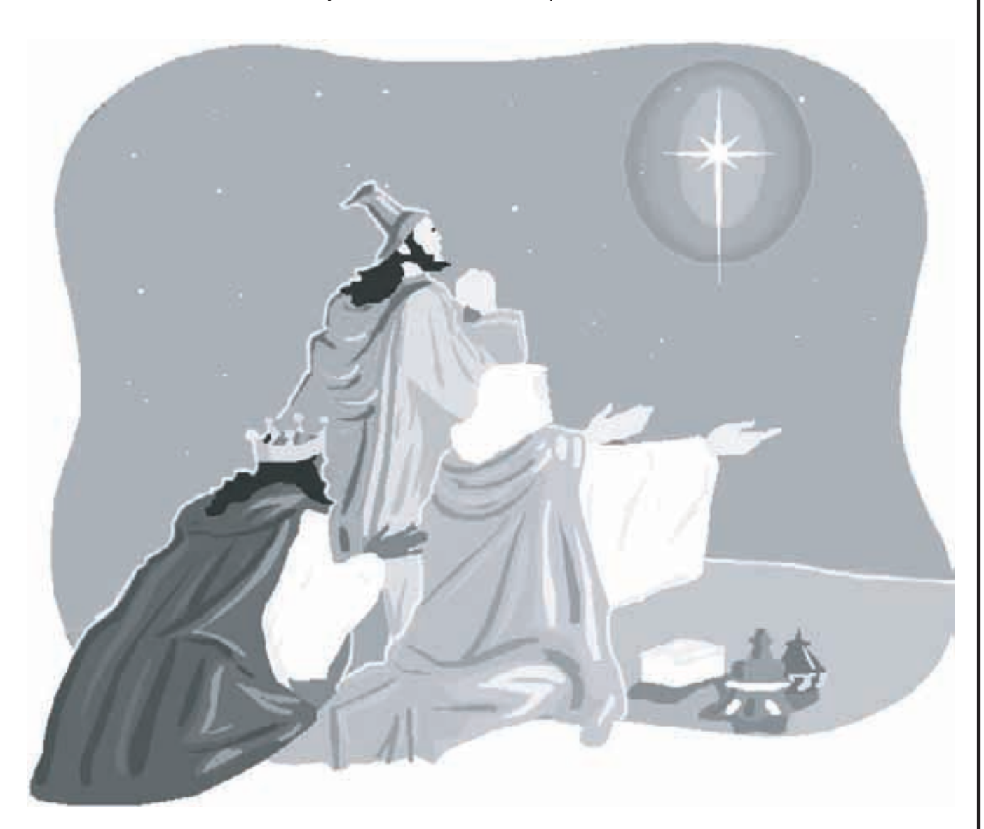
We saw his star in the East and have come to worship I Cim.

Rectory: 705-435-0131 www.stpaulsalliston.com