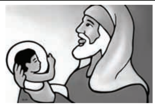
Feast of the Holy Family ~ 28 December 2014

"My eyes have seen your salvation, which you have prepared in the presence of all peoples, a light for revelation to the Gentiles and for glory to your people Israel." Luke 2: 30-32